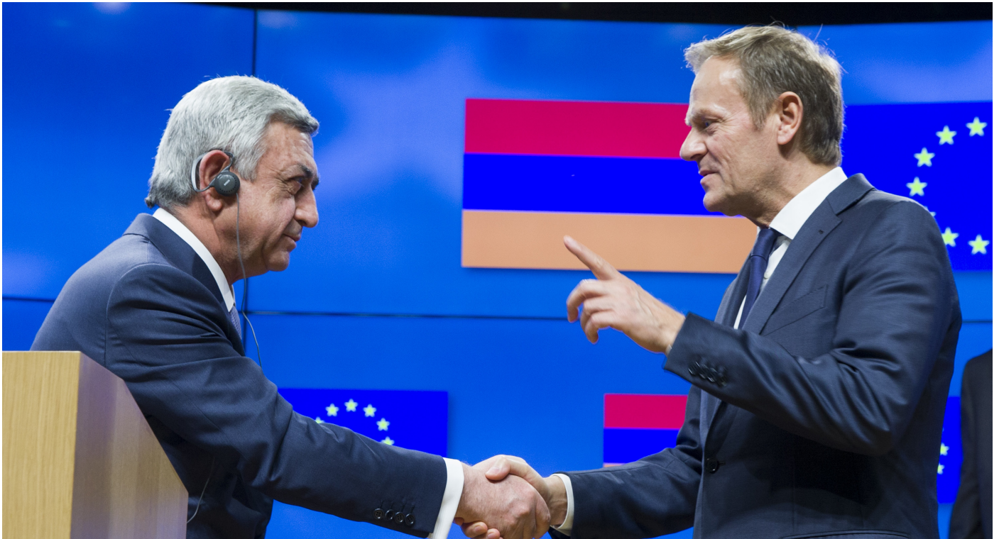
The new legal framework agreement discussed during the official state visit of the Armenian President to Brussels.

In February Armenia faced renewed fighting over Nagorno-Karabakh, although the country managed to conclude a new agreement with the EU.