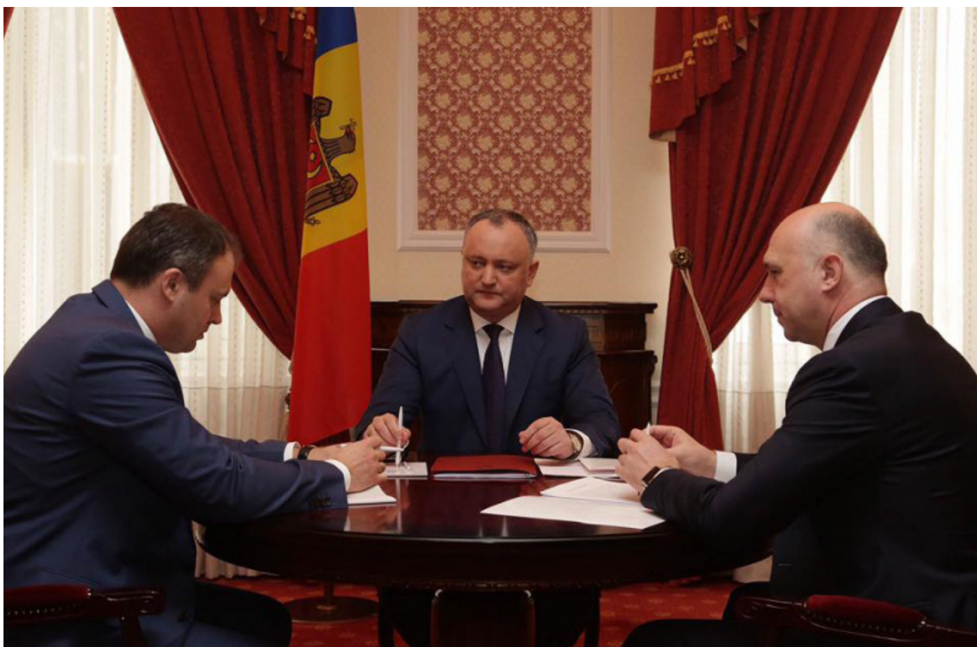
The meeting of Moldovan President Igor Dodon, Prime Minister Pavel Filip, and Speaker Andrian Candu.

Despite the efforts made by the government to create the impression of stability in the country, Moldova remains highly divided politically and economically weak. This condition is further exacerbated by the East-West geopolitical cleavage as well as security risks emanating from developments in Ukraine and the Transnistrian region.