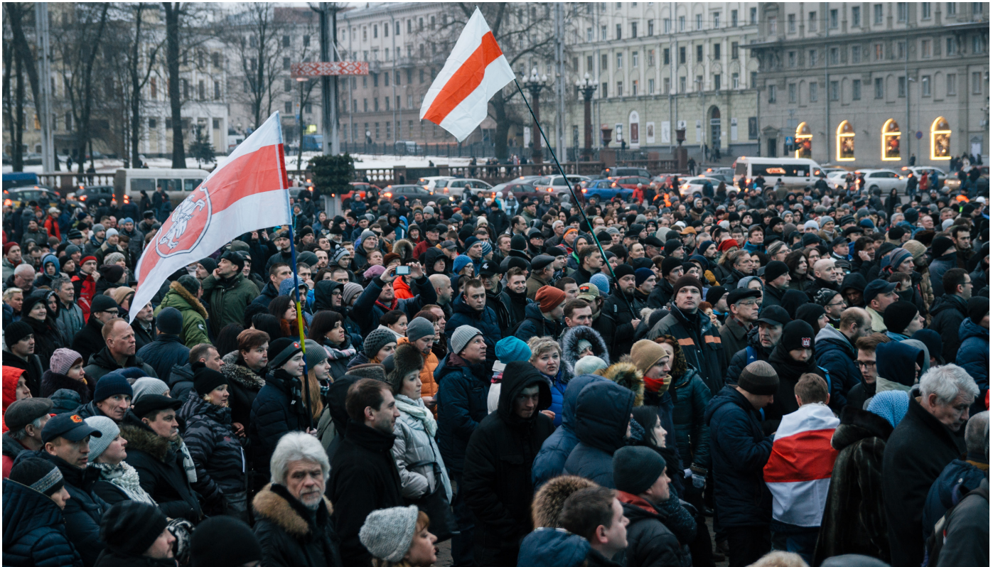
Mass protests against the so-called “Decree on social parasites”.

February turned out to be restless for Belarus. The necessity of long-overdue economic reforms and, as a consequence, the country's dissatisfaction with its socio-economic situation has resulted in mass protests on the streets of the capital and in the regions. At the same time, the conflict with Russia has entered a new stage, further aggravating the situation in the country.