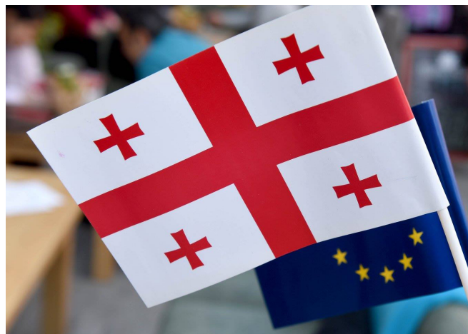
European integration turned out to be an important process for fighting corruption in Georgia

Open Government Partnership (OGP) is a multilateral initiative that aims to secure actual governments’ commitments to promote open governance and trans-