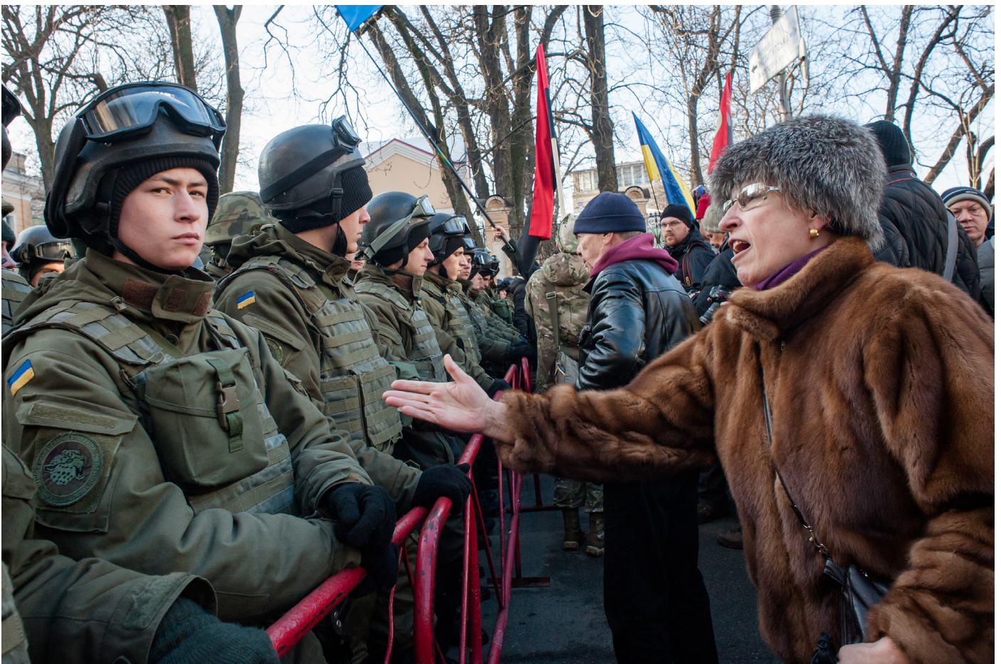
A clash between the supporters of the blockade of Donbas and law enforcement agencies in Kyiv.

After a relative lull in January, February for Ukraine was rich with various events. Most of them had a unifying topic, namely the situation in Donbas and Certain Areas of Donetsk and Luhansk Regions as well as relations with Russia. In this context, some progress on European and American tracks gave reason to cautious optimism.