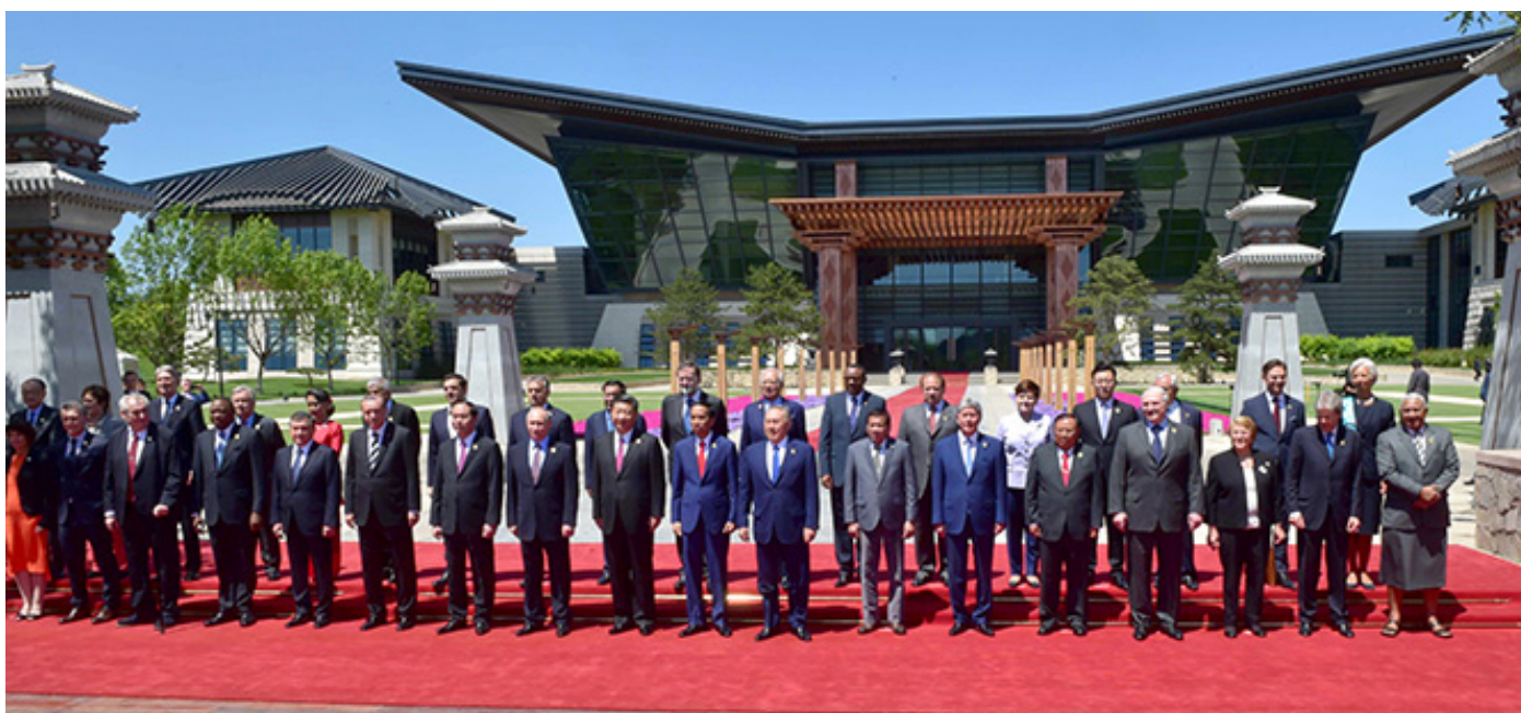
Participants of “One Belt, One Road” Forum.

In May the Belarusian authorities, on the one hand, continued reducing the pressure trying to get back to the policy of the national unity, and avoiding both Russophobia and any accusations towards to the West. On the other hand, they were obliged to incur the expenses, connected with the crisis in February-March, 2017.