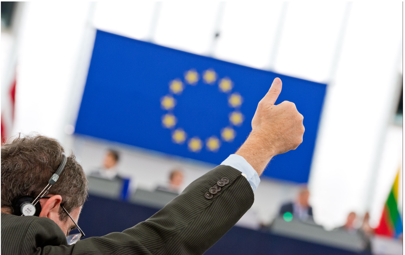
Eastern Partnership countries all demonstrate the course of deepening ties to the EU.