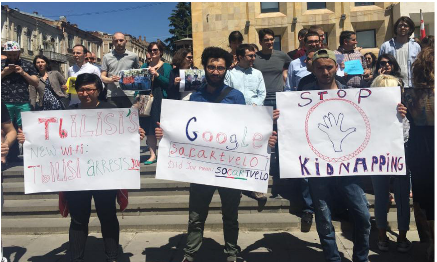
Media protest in Tbilisi after the kidnapping of Azerbaijanian journalist.

Georgia became the fifth non-member state to host the NATO Parliamentary Assembly session. The leaders of the country reaffirmed their course not towards the Membership Action Plan, but towards the very membership in the organization. On the last day of the session, an Azeri journalist was abducted in Tbilisi, that raised some questions regarding the role of the Georgian special forces in this situation.