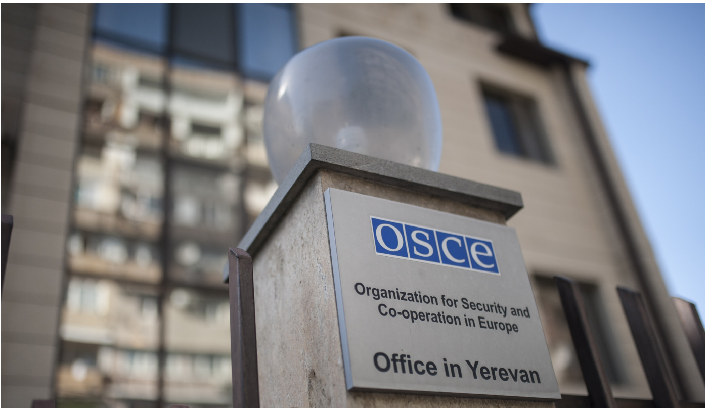
Azerbaijani diplomatic pressure forced the closure of the OSCE office in Yerevan.

Just six weeks after the parliamentary elections, a municipal election in the Armenian capital Yerevan on 14 May saw the return of the ruling Republican Party. With more than 71% of the vote, a mere 41% of voters actually turned out, largely due to the combination of the voter fatigue and a sense of resignation over the dominance of the incumbent party. But Armenia weathered the political storm as new signs of an improved economy, buoyed by a rebound in remittances, bolstered the government. Although foreign policy was again dominated by the Nagorno-Karabakh conflict after an Azerbaijani missile strike.