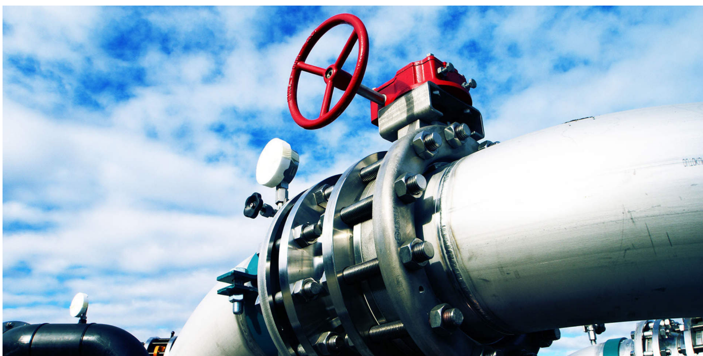
Azerbaijan drops out of negotiations on buying a share of Greek national gas transmission system operator DESFA.

In May, Azerbaijan ends four-year-long negotiations on buying a share of the Greek national gas transmission system operator DESFA with no result. The country's partnership with Russia faces a new crisis, while the window might open up in relations with the USA.