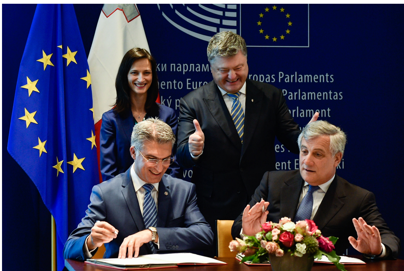
Solemn ceremony of signing the document on visa liberalisation with the EU for Ukrainians.

In May, the political and economical Ukrainian agenda remained closely connected to Russia. Russia and pro-Russian militants continue shootings of the government controlled areas in the east of Ukraine. Kyiv toughens its stand on the sanctions imposed on Russian businesses, and blocks the Russia’s information and propaganda influence channels, while the Western countries call on Kremlin to fulfill the Minsk agreements.