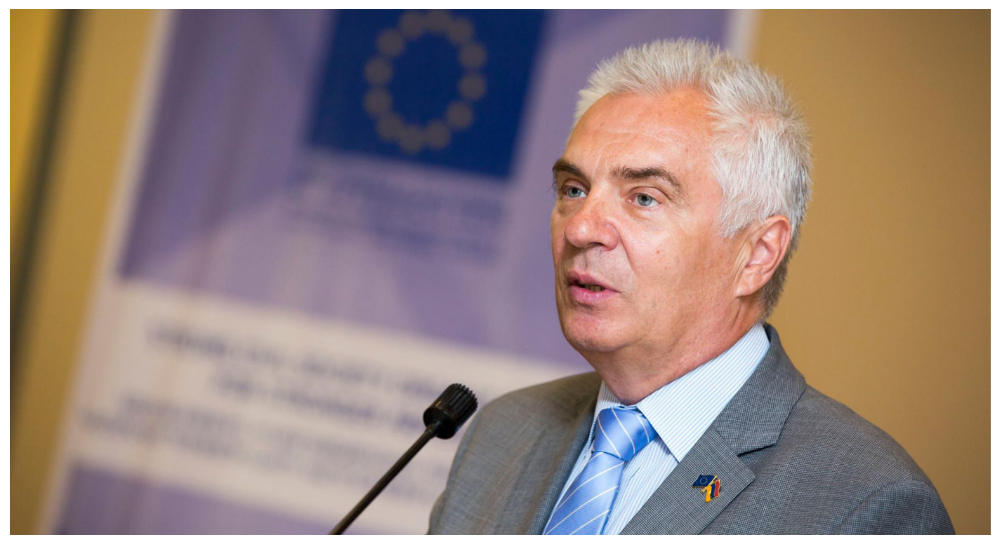
Statement by head of the Delegation of the European Union to Armenia causes a surprising new political war of words.

A simmering rivalry between the Armenian president and the prime minister drives a new degree of the domestic political discord, with an added distraction from a surprisingly scathing attack on the EU by some government officials. Yet the deeper and more demonstrable concern was the contradiction between the Armenian government's optimism over the economy and the statistical reality of the ballooning debt. Meanwhile, Armenian foreign policy continued to face the challenges of a mounting tension and a heightened risk of the renewed hostilities over the Nagorno-Karabakh conflict, only exacerbated by more Russian weapons deliveries to Azerbaijan.