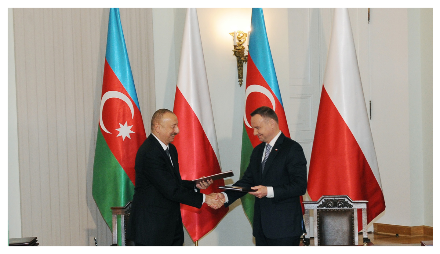
Presidents have signed documents that expand economic, scientific, and political cooperation between Poland and Azerbaijan.

The Azerbaijani domestic agenda in May was yet again overshadowed by the escalation of the Nagorno-Karabakh conflict. While the Qatar crisis put the economic stability of the country in danger as well. Though the Azerbaijani foreign policy gives some hope for the a better future.