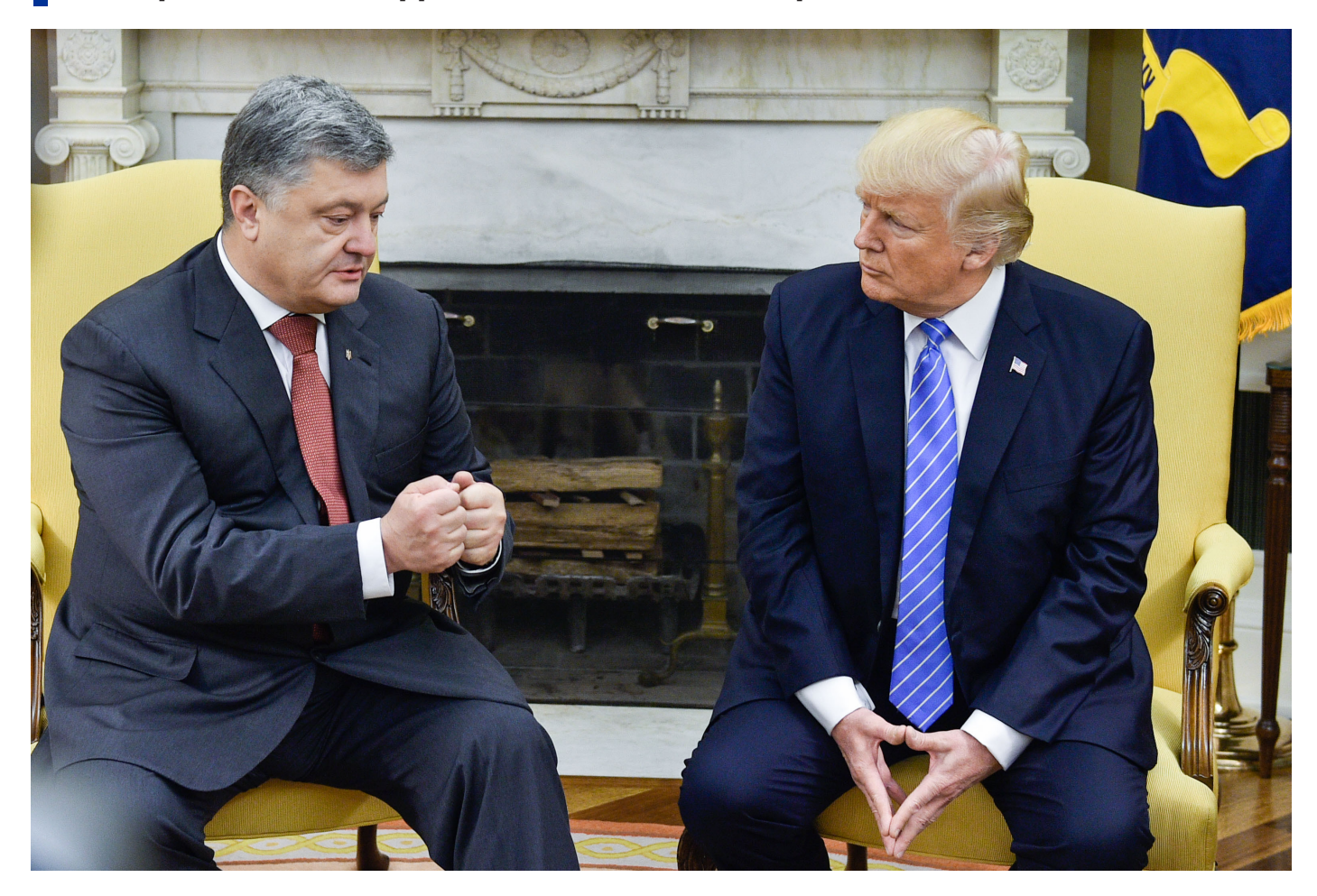
The meeting of President Poroshenko with U.S. President Donald Trump is already a positive result.

While the domestic events in Ukraine were about the notorious corruption cases, on the foreign policy arena June brought quite a lot of success and a series of the important victories for Ukraine. As for its economy, the country deserved both praise and disapproval from its Western partners.