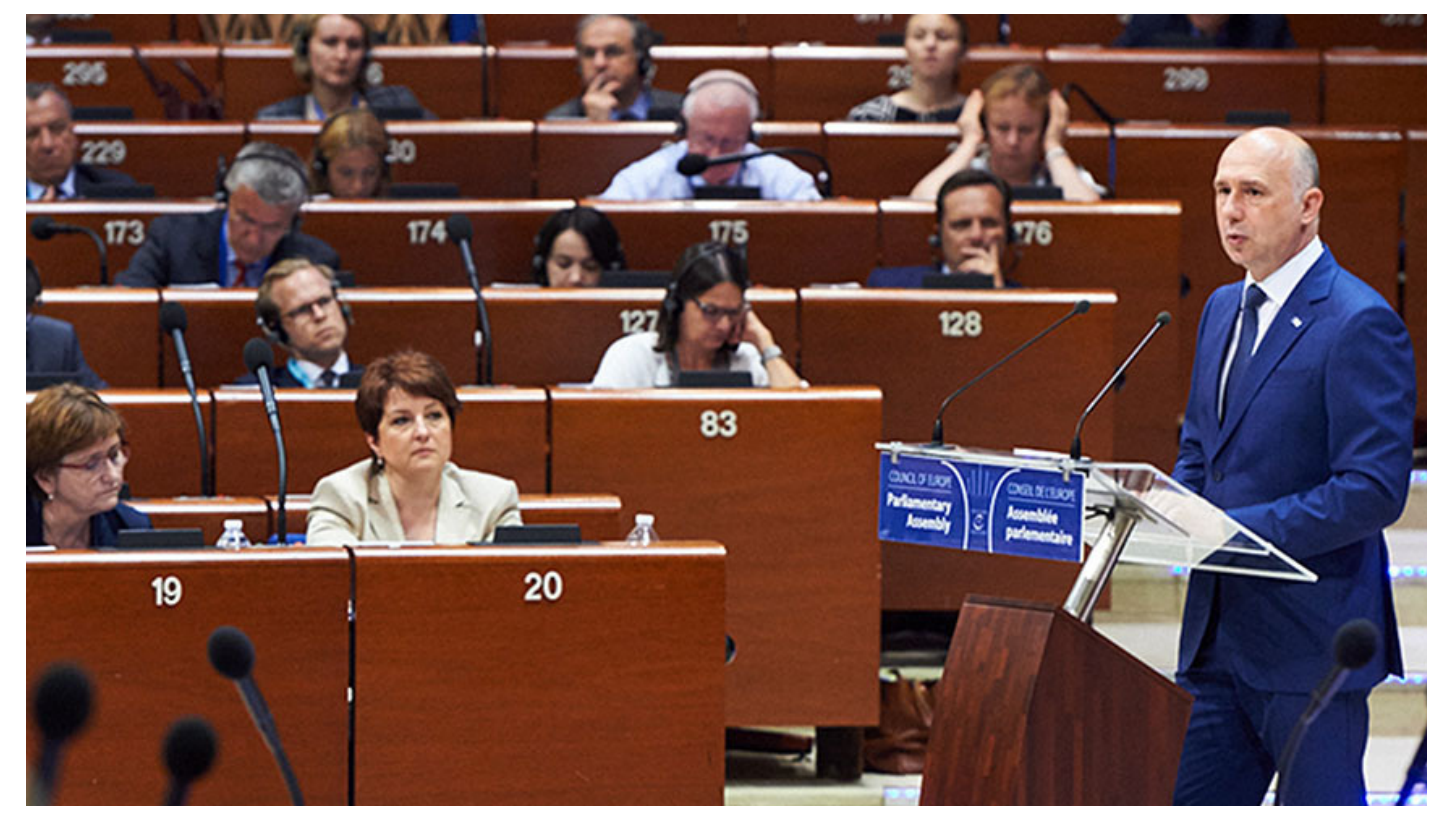
Prime Minister Pavel Filip visited Brussels.

The Moldovan authorities still continue to promote the change of the electoral system before the 2018 parliamentary elections, despite the negative conclusions provided by the Venice Commission and the concerns expressed by the main development partners. At the same time, in the economic field, experts forecast a 6% growth of the Moldovan GDP in 2017. The foreign policy still evolves in the traditional East-or-West discourse.