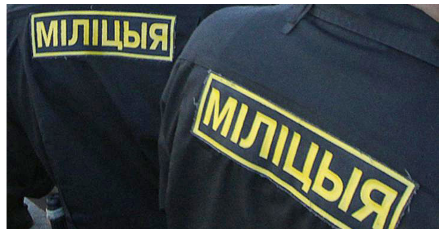
Law enforcement agencies grow power.

The national security, defense and law enforcement agencies of Belarus are becoming more powerful, therefore raising concerns that the President no longer controls them as he himself is under their control. The economy of the country is showing a positive upward trend, playing into the hands of those opposing reforms. As for its foreign policy, some progress was seen in the relations with Russia, while the relations between Belarus and China have deepened as well.