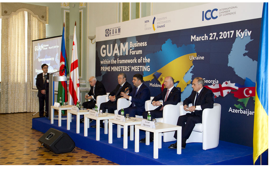
EaP countries have already tried the multilateral collaboration on the energy security issues in the GUAM Organization for Democracy and Economic Development.

In the light of the previous observations, the following actions are recommended: