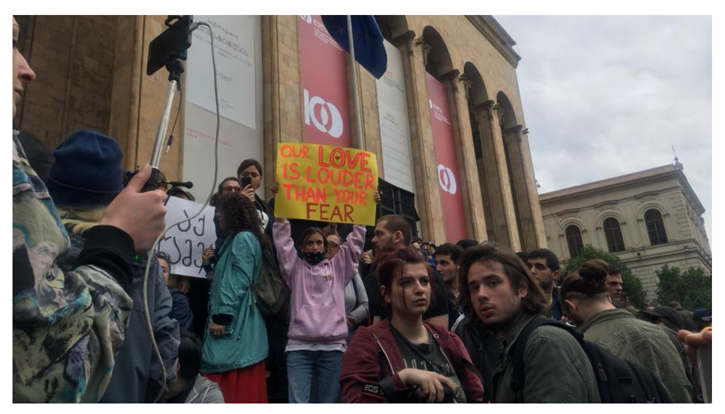
Street protest against the underqualified investigation of the two murdered schoolboys case.

The first six months of 2018 turned out to be rather difficult for Georgia. The situation in the country was heated to the brink by the series of protests leading to the resignation of the Prime Minister. The new government faced a range of acute issues – from economic and judicial reforms to Georgia's Euro-Atlantic integration.