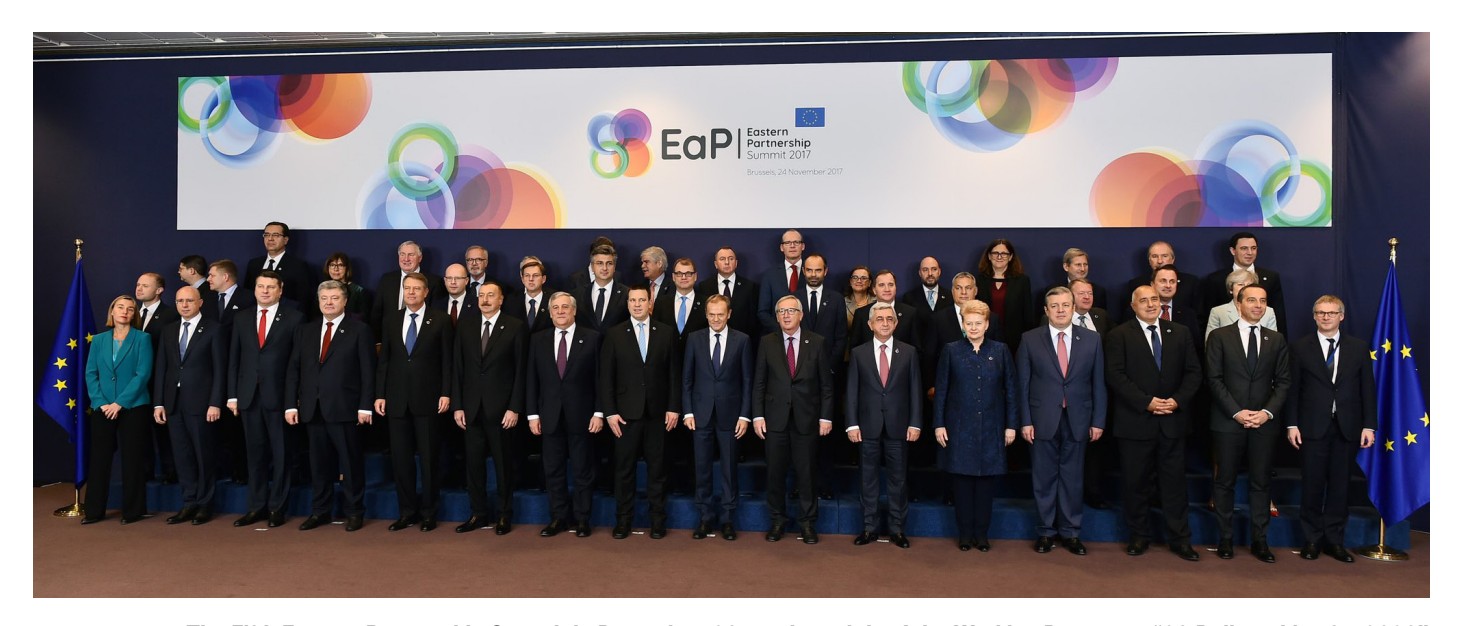
The Fifth Eastern Partnership Summit in December, 2017 adopted the Joint Working Document "20 Deliverables for 2020"

A Joint Staff Working Document "20 deliverables for 2020" has become yet another attempt to specify the vectors for the EaP development, which would be based upon real progress in reforms and democratic transformations in partner states with the support of the EU. In fact, the entire action plan for the upcoming years provides the understanding of tangible results expected from the cooperation. So what framework has been set for the Eastern Partnership policy?