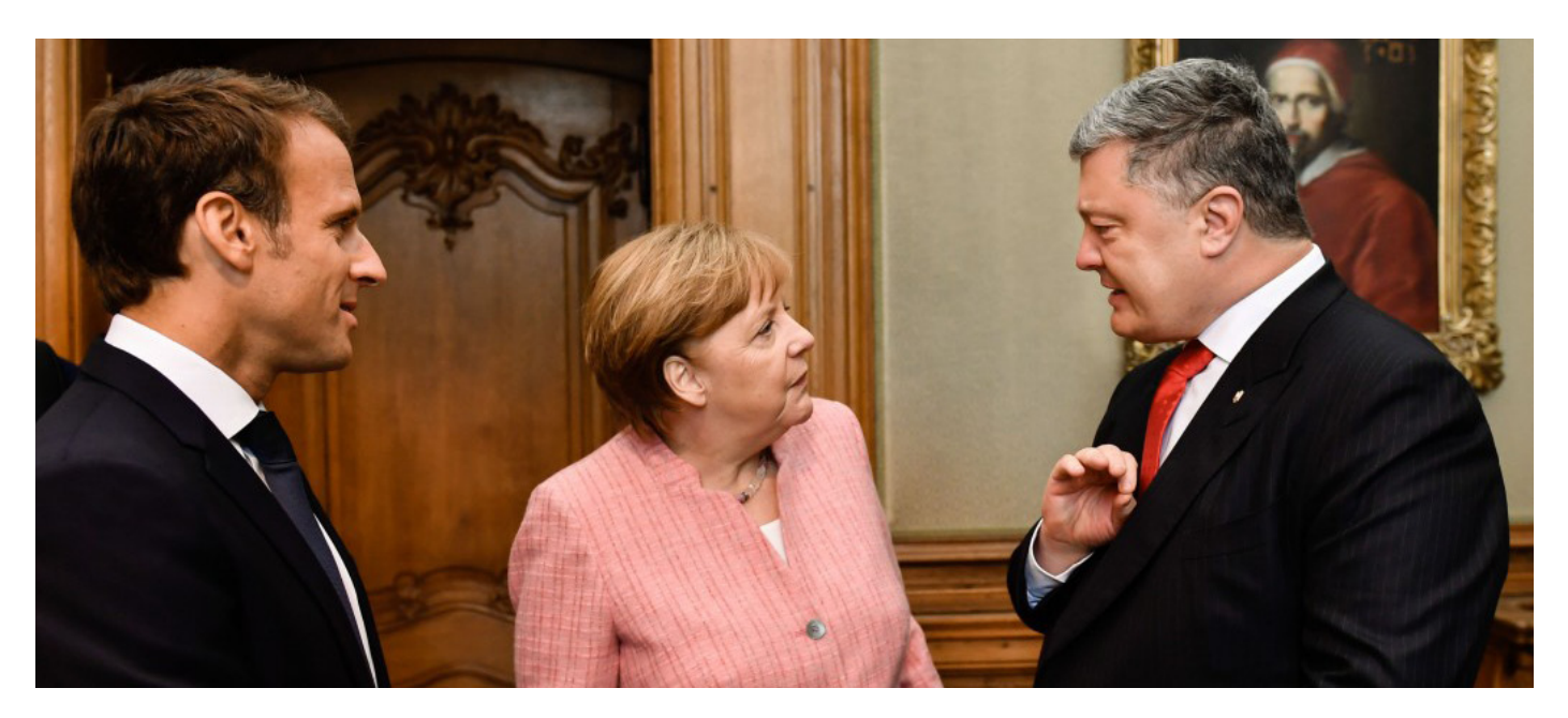
Meeting of the heads of Normandy format states in Aachen.

In the first half of 2018, Ukraine's domestic policy got a pronounced pre-election tint. At the same time, foreign policy showed the positive dynamics in the relations with the EU, Germany in particular. But the relations with Russia remain conflicting with the militants in the east ignoring the ceasefire.