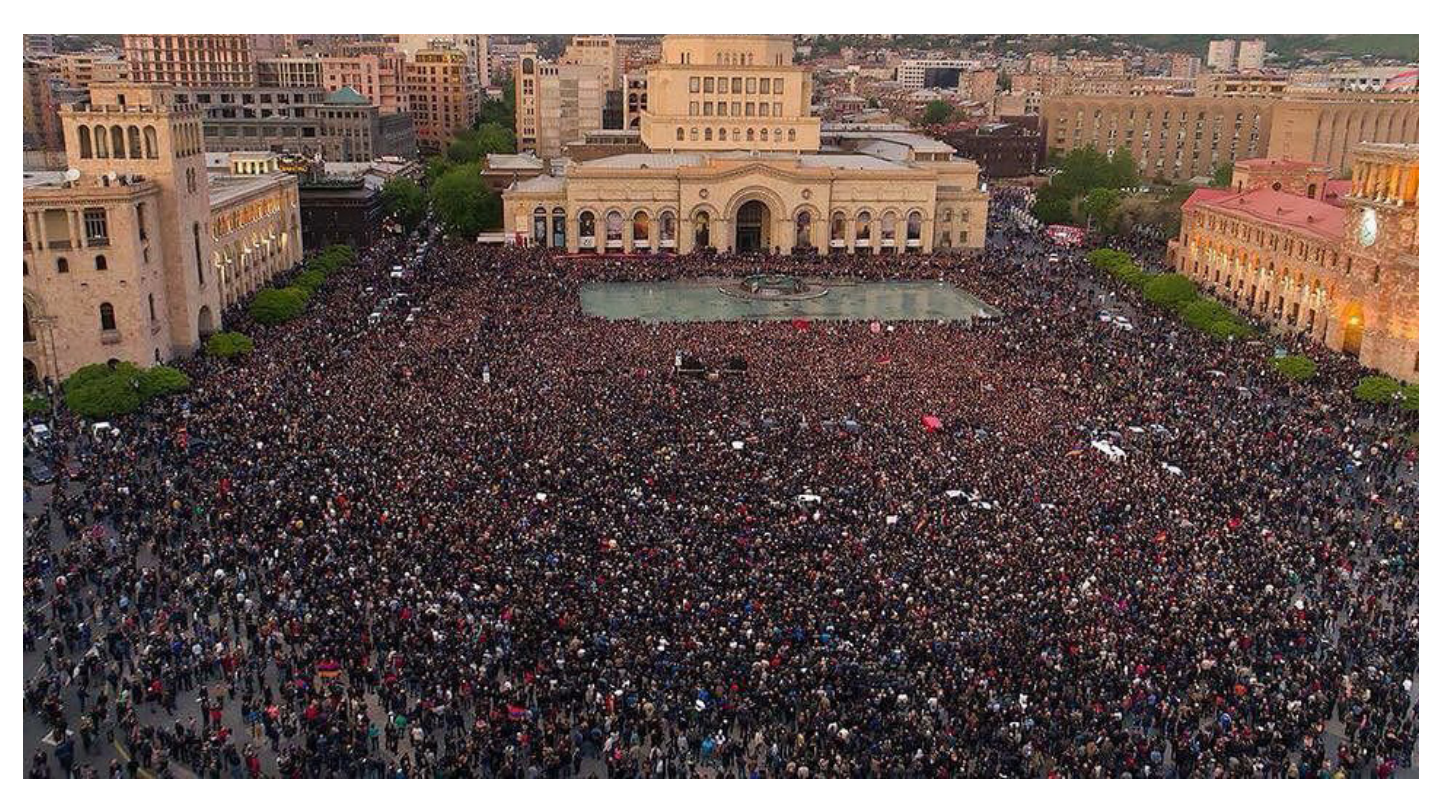
Peaceful protests against the continuation of Sarkisian as the head of state on the streets of Yerevan.

For the first half of the year, the dominant focus in Armenia was the completion of the country's long-awaited transformation from a semi-presidential to a parliamentary form of government. Based on the new Armenian constitution, the full change was due to be completed by April 2018, with the selection of a new prime minister as the new operational head of state after an indirect election for a new, largely symbolic president in March 2018.