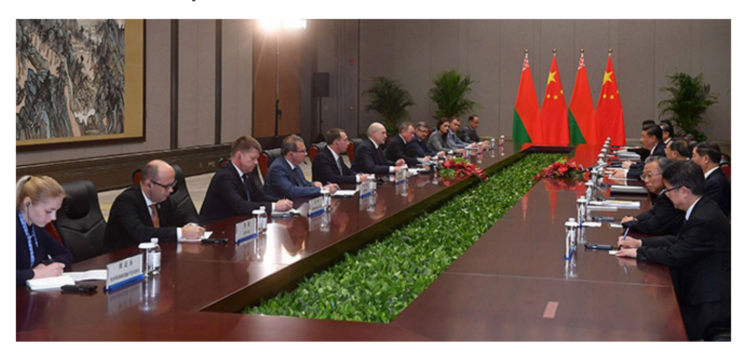
Cooperation with China is an important direction for balancing Belarus foreign policy. Bilateral talks during the Shanghai Cooperation Organization Summit.

Belarus authorities began preparations for the presidential and parliamentary elections and tried to ease the protest mood with the financial methods. In foreign policy, the trend of balancing between Russian, European, and Chinese directions is still preserved.