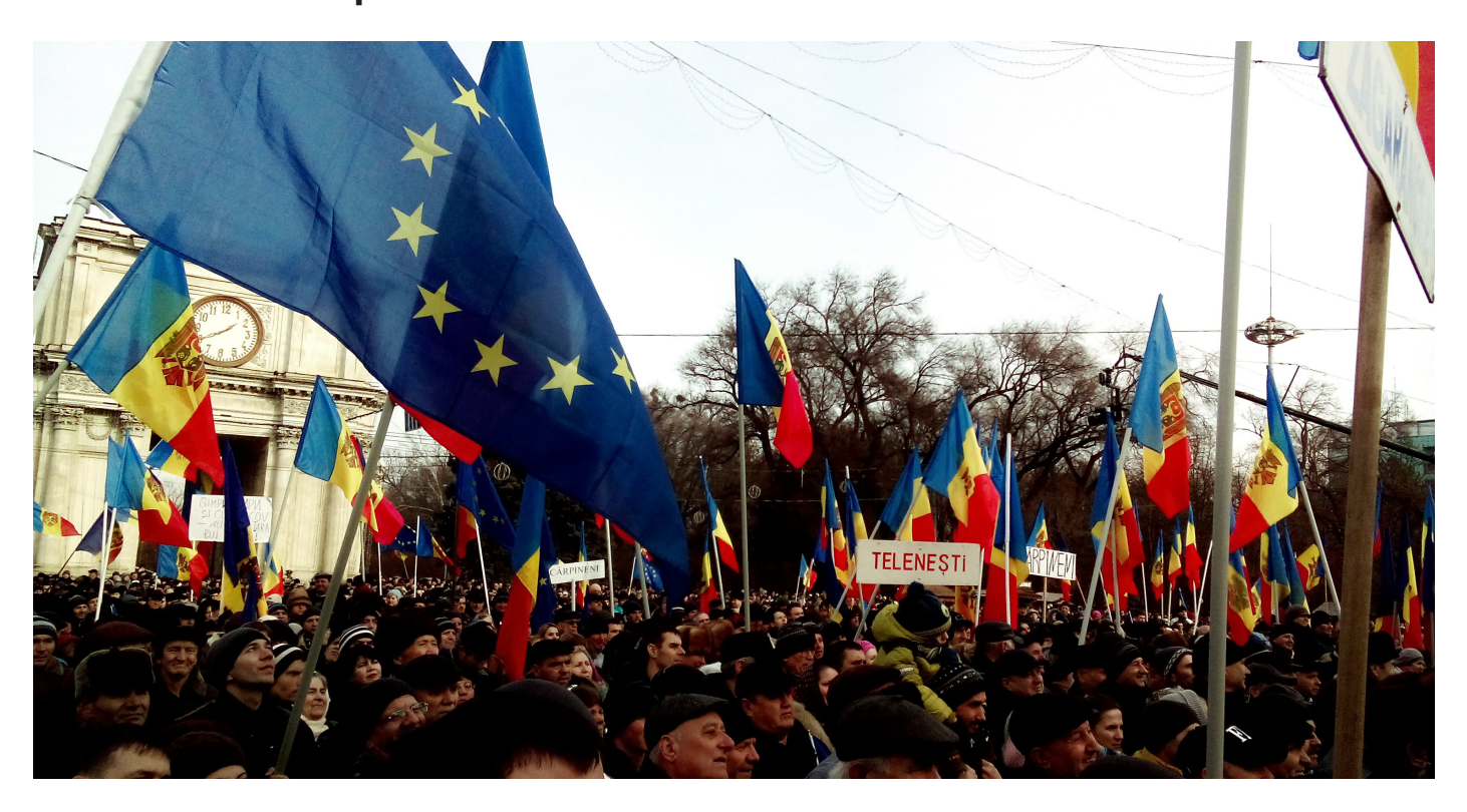
Streets of Chisinau protest the Supreme Court decision to declare the result of the mayoral elections null.

During the first half of 2018, the Republic of Moldova consistently lowered its democracy level by undermining fundamental human rights and violating the rule of law. Celebrating four years after signing the Association Agreement turned out to be deplorable due to the lack of consistent reform implementation and repeated concerns expressed by the development partners. The invalidation of the mayoral elections in Chisinau confirmed by the Moldovan Supreme Court of Justice on the evening of June, 25 not only manifested the lack of transparency and independent judiciary but also reinforced the state capture status of the Republic of Moldova.