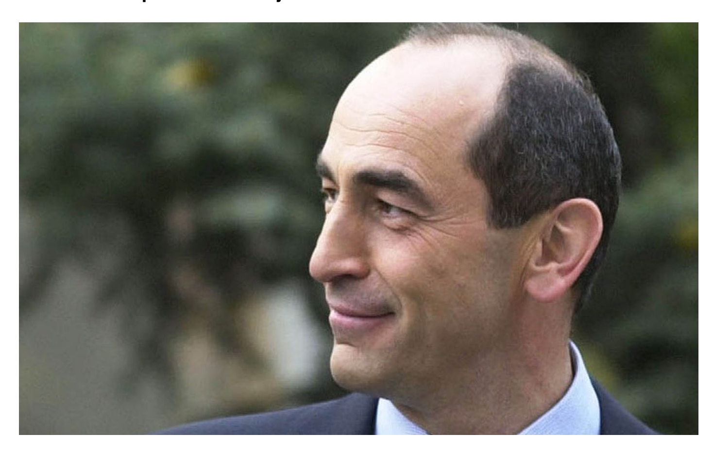
Ex-president Kocharyan charged over 2008 crackdown.

Since stepping into power on the wave of mass protests in April-May 2018, the Armenian government has struggled to sustain momentum. New authorities are focusing on intensifying their drive against corruption and reversing over a decade of politics largely defined by the culture of official entitlement and impunity. And in the face of dangerously high expectations, the government of Prime Minister Nikol Pashinyan is also burdened with the need to produce results, especially given the political risk of crucial parliamentary elections that seem to be put off until next year.