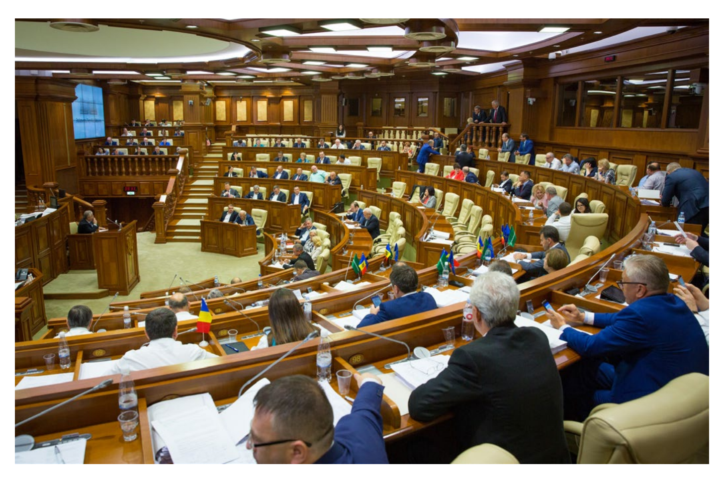
Scandalous laws adopted by the parliament triggered international concerns yet again.

The democratic downfall of the Republic of Moldova triggered the revision of the EU – Moldova relations and the positioning of the main development partners. A resolution on the domestic political crises was adopted in the European Parliament, followed by the harsh reaction of the Moldovan government and political elites. Continuing to disregard the European commitments, the Moldovan parliament hasty approved the package of tax initiatives and capital amnesty apprehended with deep concern by the international organizations.