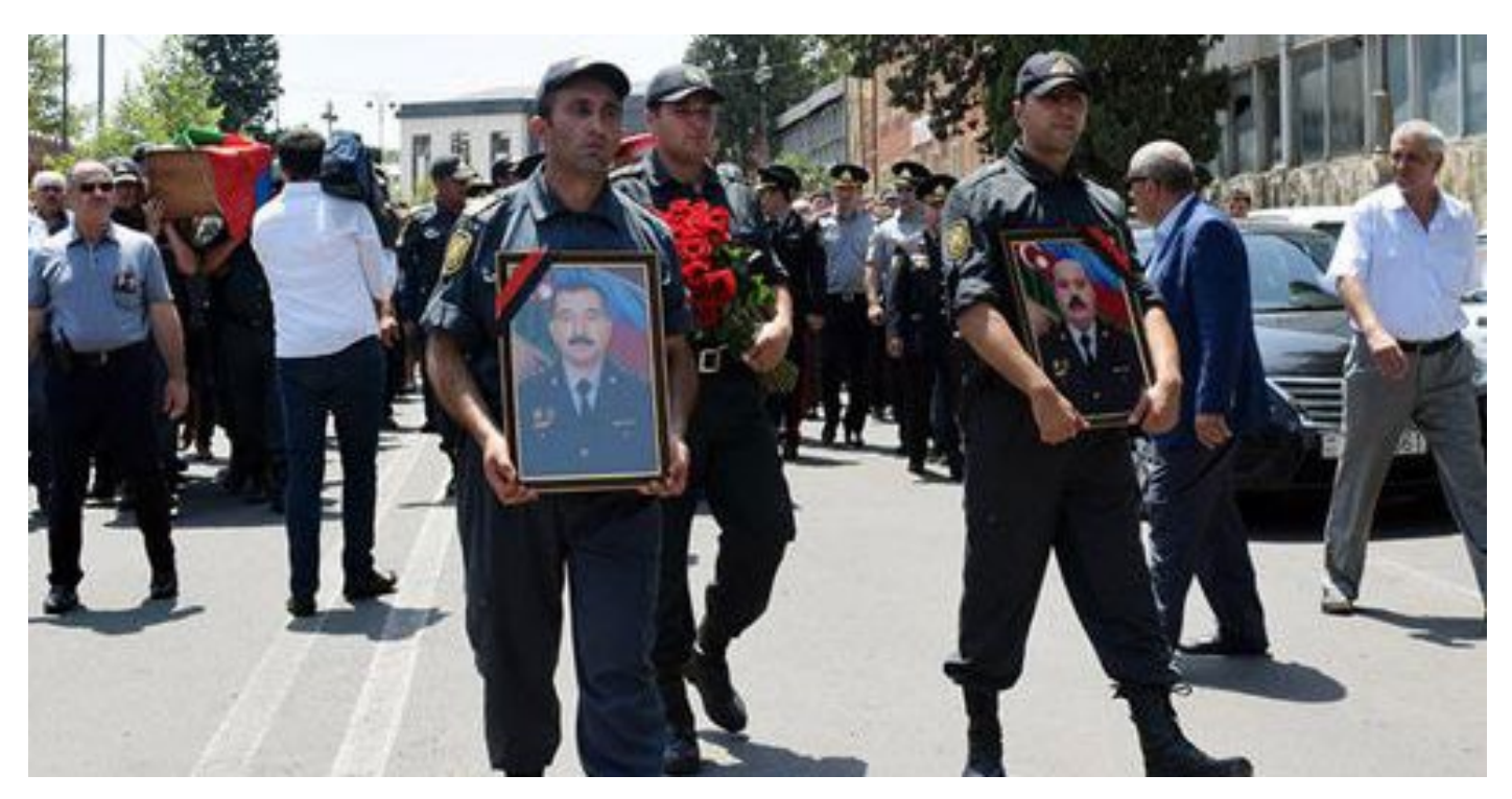
Two police officers were killed during street protest in Ganja city.

The increase in oil prices caused amendments to the state budget. Domestic agenda was dominated by a large-scale electricity outage in the country and Ganja events. However, in the foreign policy, the president's visit to France and approved EU-Azerbaijan Partnership Priorities gave some hope for the future.