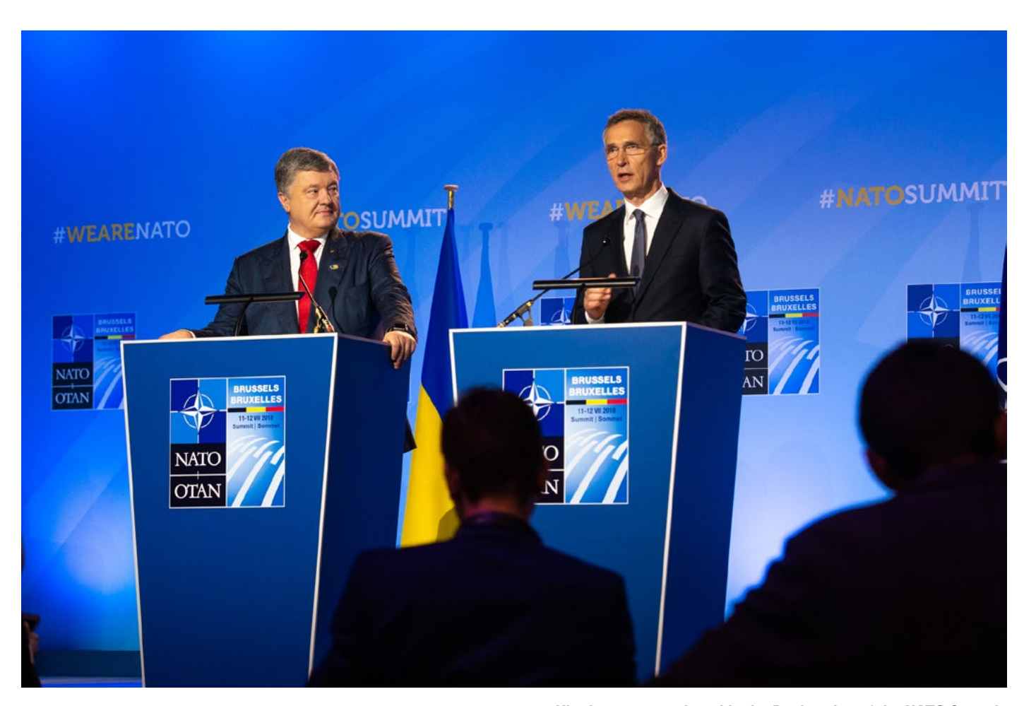
Ukraine was mentioned in the Declaration of the NATO Summit.

In July, Ukraine yet again appeared on the agenda of the international institutions: NATO, the EU, the IMF. The country was mentioned during the Trump-Putin summit too. At the same time, the fight against corruption was of current interest on the domestic political front.