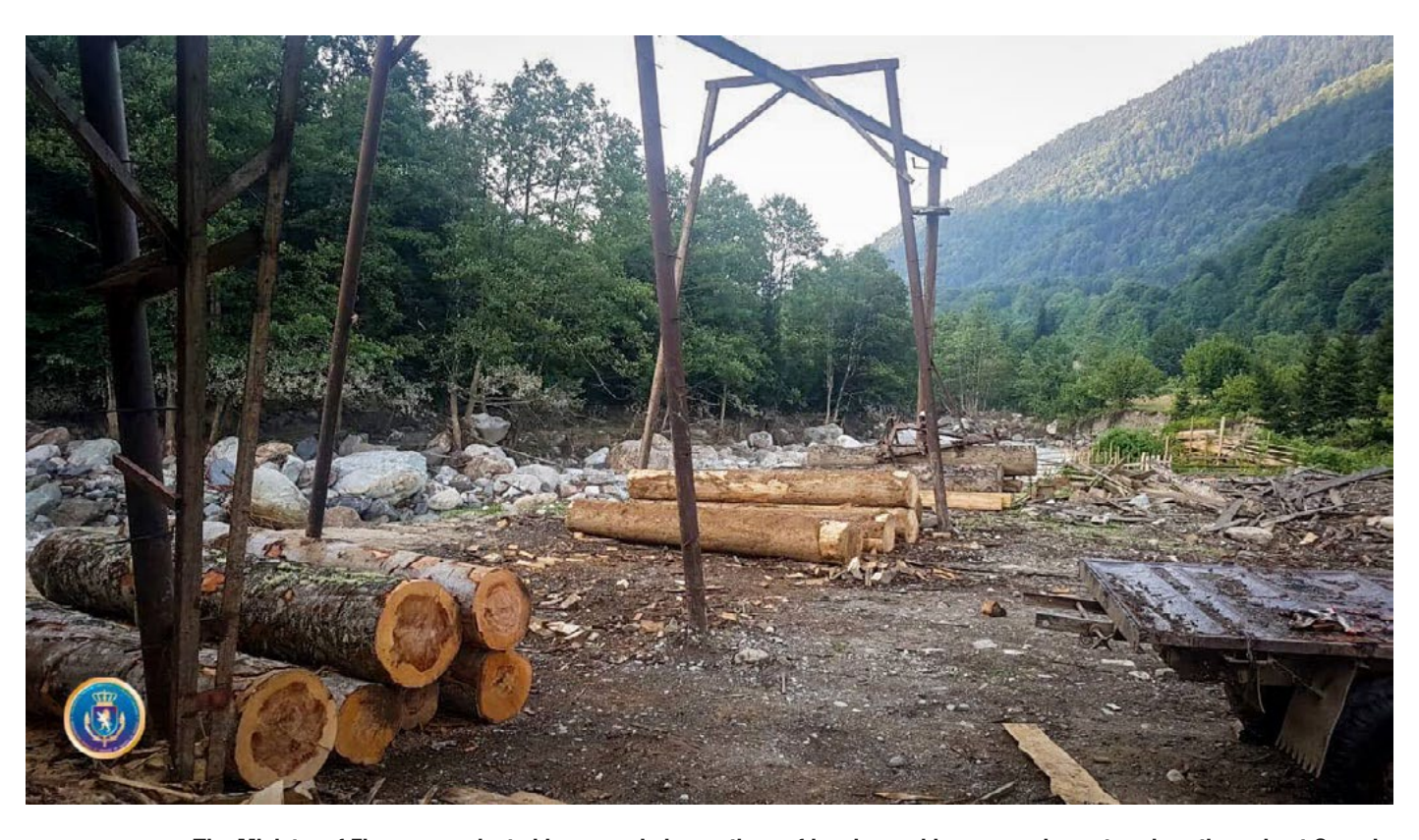
The Ministry of Finance conducted large-scale inspections of logging and leoprocessing enterprises throughout Georgia.

Georgia is preparing for the next presidential elections to be held this fall. These will be the last direct presidential elections. What is more, the head of state will be elected not for five years as before, but for six. In the future, according to the changes to the Constitution, these are 300 members of the Electoral Commission who will vote for the head of the state. It will be the responsibility of 300 members of the Electoral Commission to vote for the head of state.