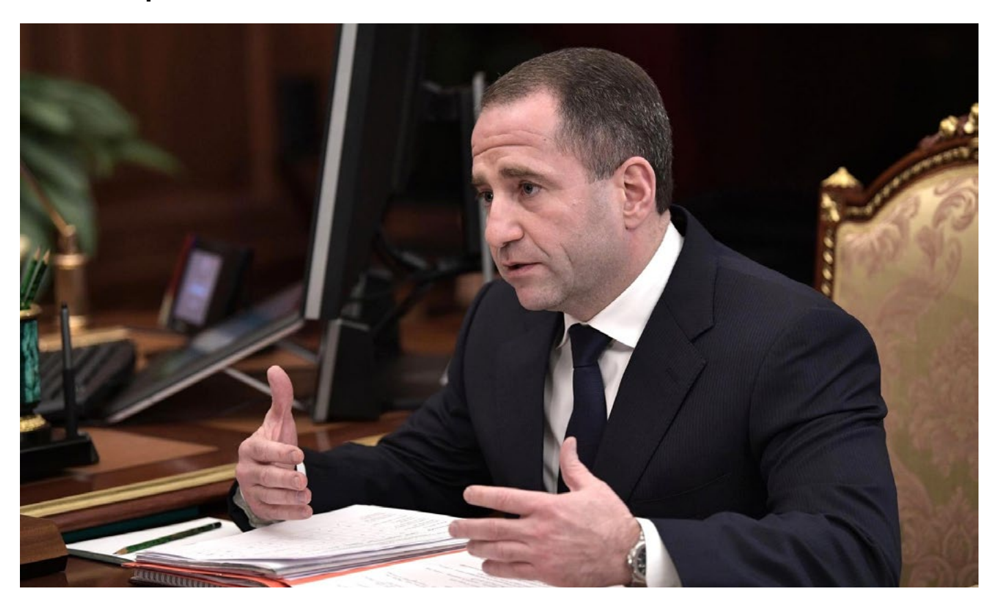
The appointment of the "ambassador of war" Mikhail Babich to Belarus can be a signal of strengthening the Kremlin's pressure.

The trade wars with Russia and the Moscow's desire to limit the use of the European raw materials which are "under sanctions" can cost Belarus not only profits but also the trust of the Western partners. The Kremlin also presses Minsk through diplomatic channels, imposing Mikhail Babich, the "Ambassador of War" to take post in Minks.