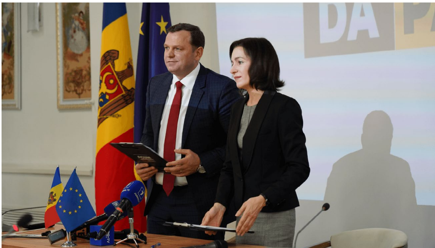
Maia Sandu and Andrei Năstase signed an agreement to form the ACUM bloc (Now) on December 16.

As Moldova was getting ready for the winter holidays, preparations for the parliamentary elections scheduled for February 24 were in full swing too. ACUM (Now), the pro-European and anti-oligarchic bloc was formed, led by Maia Sandu, the head of the Party of Action and Solidarity (PAS), and Andrei Năstase, the head of Dignity and Truth Platform Party “DA”. Moldovan parties published lists of candidates by constituency demonstrating the faults of the mixed electoral system. For the fifth time now, Moldovan President Igor Dodon was suspended from office for yet another refusal to promulgate the laws proposed by the Parliament.