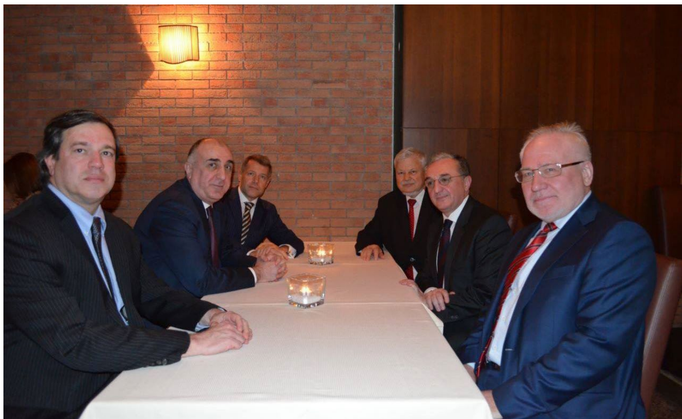
Top diplomats of Azerbaijan and Armenia held negotiations at the OSCE Ministerial Council Meeting in Milan.

In December, President Ilham Aliyev approved the state budget for 2019. Although revenues increased by 3.5% compared to 2018, the state budget deficit is expected to widen. In accordance with the new state budget, the country's tax code experienced changes in order to stimulate economic activity, reduce "shadow economy", and increase transparency. Foreign policy agenda of the country was dominated by the meeting between Azerbaijan and Armenia during the OSCE Ministerial Council Meeting in Milan. The joint and unilateral statements gave a positive signal about the future talks.