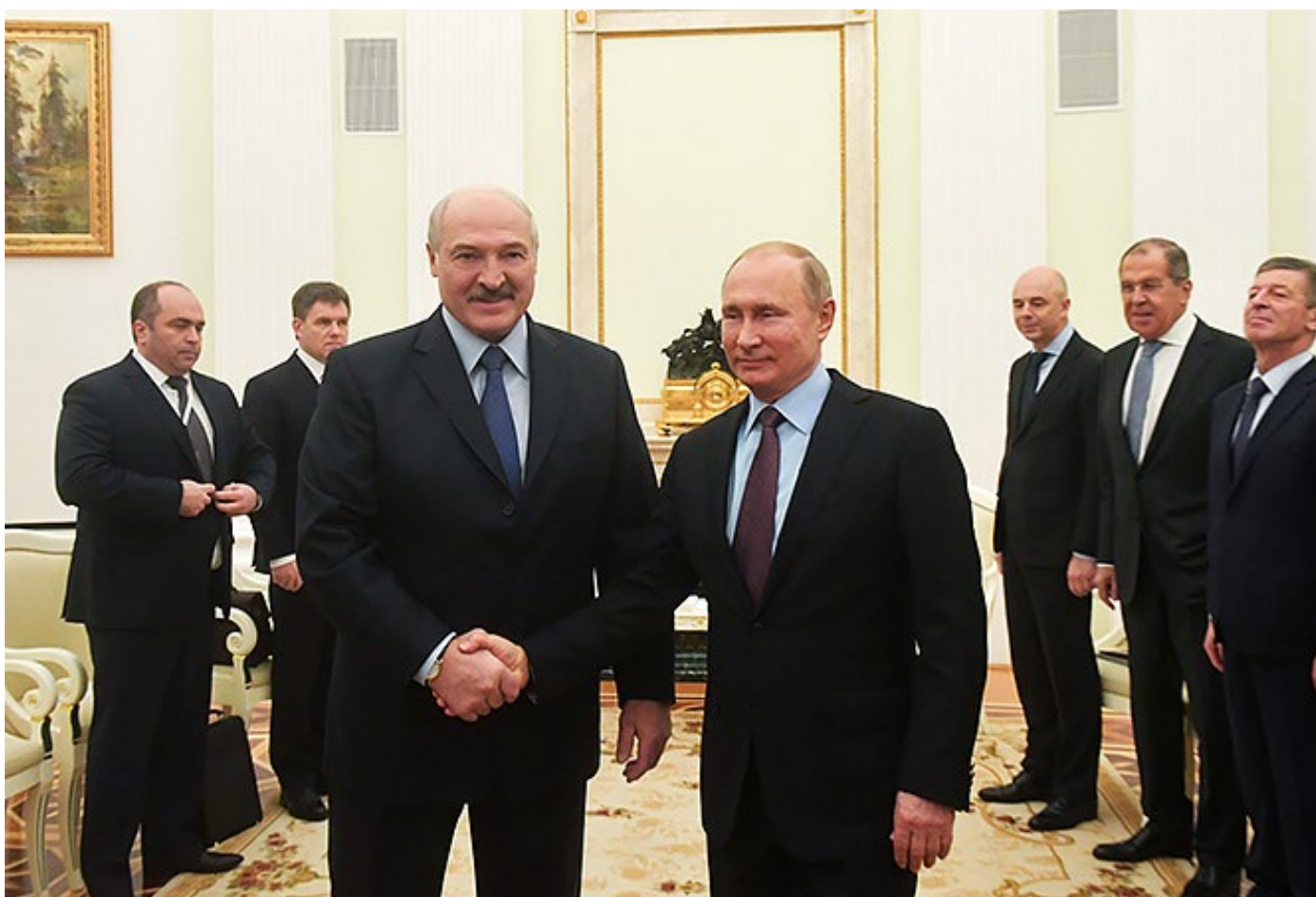
The talks between Presidents Putin and Lukashenko held on December 29.

In December, the tensions of the past years in relations between Russia and Belarus entered a new stage growing into an open conflict. The Kremlin openly declared its ambitions of integrating Belarus. It conditioned discounts for oil and gas on deeper integration between Russia and Belarus within the Union State.