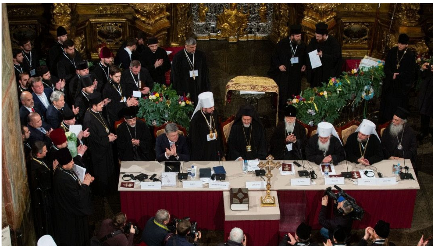
The historical agreement to establish the Unified Orthodox Church of Ukraine reached on December 15.

December was a success in improving economic performance and cooperating with international financial institutions. It brought Ukraine a long-expected unification of the Orthodox Church of Ukraine, showing that Kyiv can count on the international partners. Meanwhile, there was no progress on the Russian issue. The conflict continues and is highly likely to intensify in 2019.