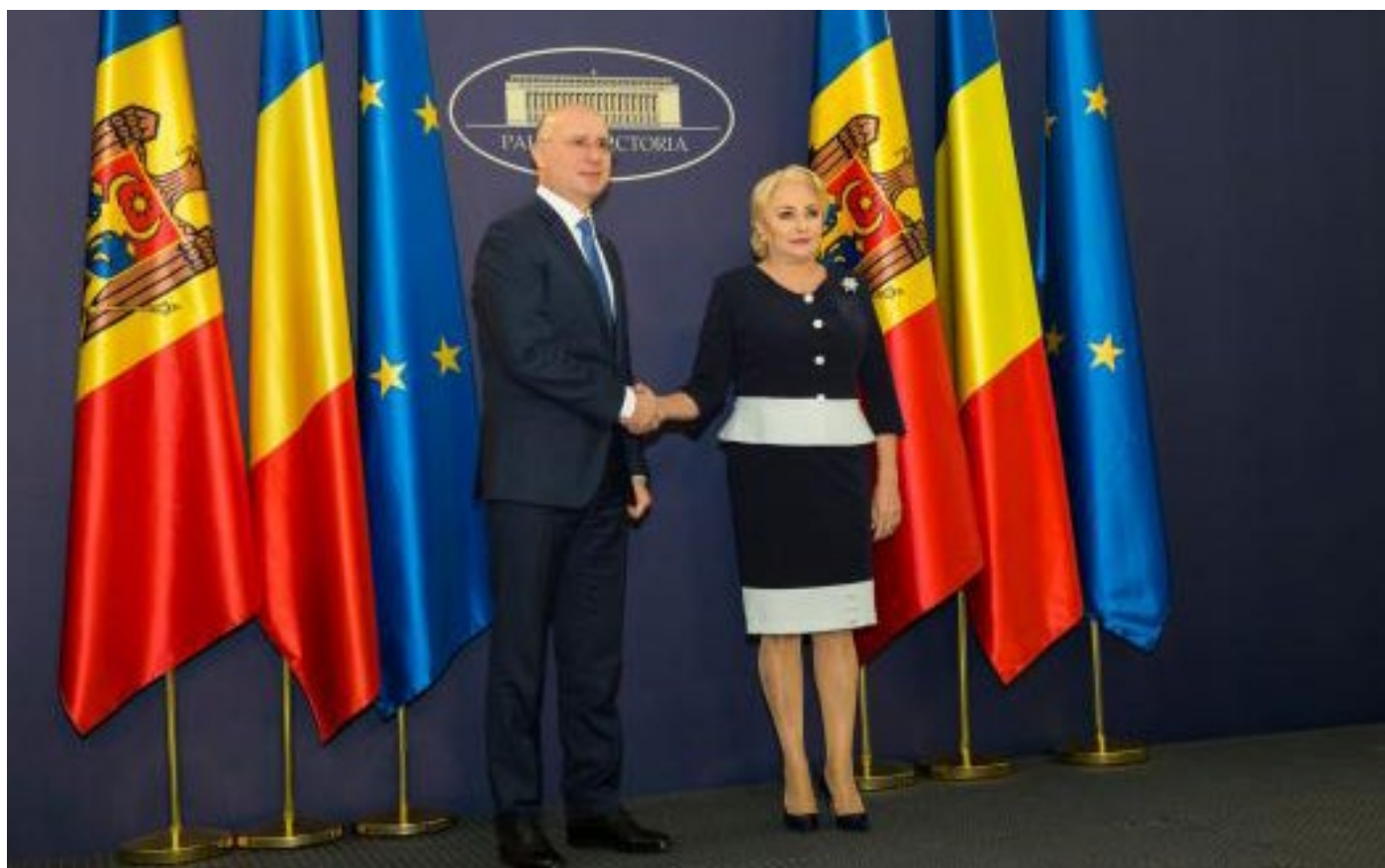
Romanian Presidency in Council of the European Union is a chance for Moldova.

Even though it is still winter outside, the degree of political heat in the Republic of Moldova is getting higher and higher. On January 25 Moldova saw the start of the race for parliamentary elections set for February 24, 2019. Opponents started their campaigns with grand promises. Romania's Presidency in the Council of the European Union provides a chance for Moldova to set its European dialogue in motion as a result of close relations with its "trans-fluvial brother". And at the end of the month the unrecognized Transnistrian government surprised Chisinau with launching their very own "diplomatic office" in Moscow.