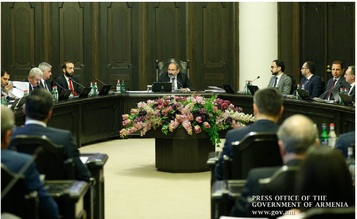
New Armenian government.

Armenia President Armen Sarkisian issued an official decree on January 14 affirming the reappointment of Prime Minister Nikol Pashinyan in the wake of the political landslide in parliamentary elections in December 2018. Reflecting the country’s dynamically new political landscape, Pashinyan’s “One Step” party secured 88 seats in the new 132-seat parliament, thereby, ushering in a second term as a premier for Pashinyan. Only two other political parties were able to garner representation in the new parliament, with the “Prosperous Armenia” and “Bright Armenia” parties winning 26 and 18 seats respectively.