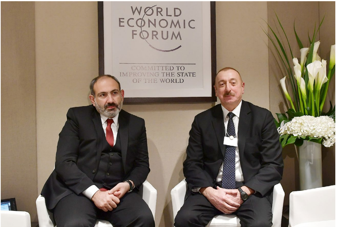
President Ilham Aliyev and Armenian Prime Minister Nikol Pashinyan held an informal meeting in Davos World Economic Forum.

In January, the Central Bank of Azerbaijan revealed its ultimate goals for 2019 and clarified what was achieved in the previous year. The foreign policy agenda of the country was dominated by the unofficial meeting of President Aliyev and Armenian Prime Minister Pashinyan. In the domestic policy, human rights are in the spotlight again.