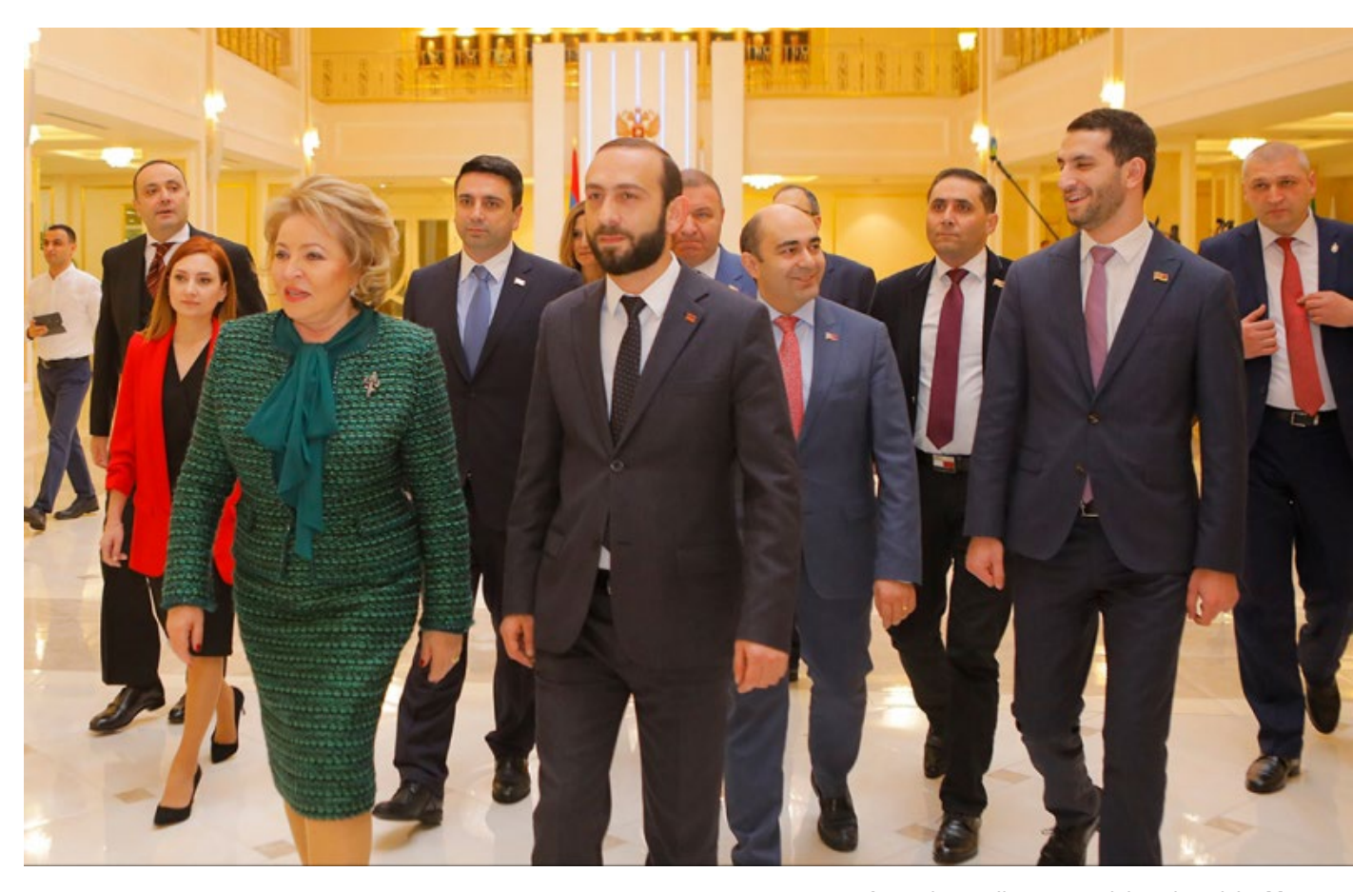
Armenian parliamentary delegation visits Moscow.

Criminal investigations against former Armenian officials are in the full sway. While the main issue on the domestic agenda is economic reforms, foreign policy focuses on cooperation with Russia in different spheres.