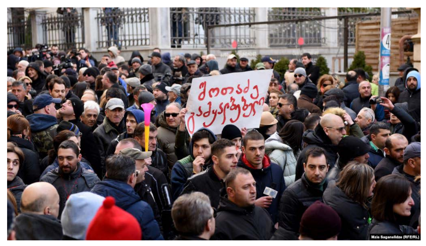
Rally near the parliament supporting changes to electoral system.

For the ruling party of Georgia the year began with several strikes. The Georgian Dream had to compromise on electoral reform. Stumbling on the "project of the century" implementation is a threat not only to country's economy and image but also to the relations with international partners.