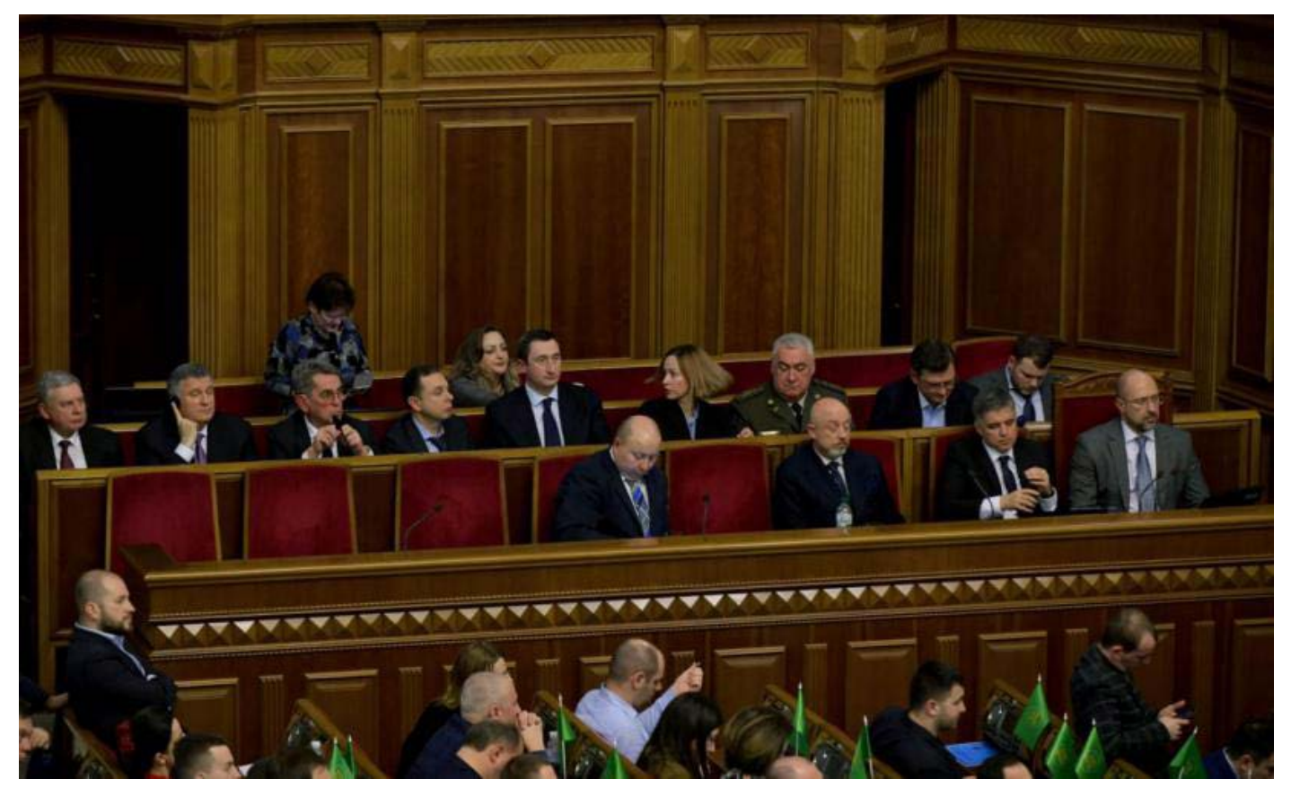
Appointment of a new Cabinet of Ministers headed by D. Shmygal.

For Ukraine, the first three months of 2020 were filled with extraordinary and sometimes tragic events, disasters, and the echo of past tragedies both on the domestic political front and in the international arena. The change of government, the new Prosecutor General, the risk of a diplomatic catastrophe at the Minsk talks are only a fraction of what shocked Ukraine in the first months of the year.