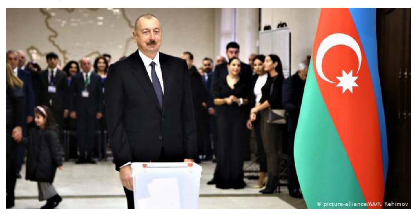
Early parliamentary elections

Early elections, new opposition arrests, drop in oil prices and threats to use the pandemic for a crackdown on opposition are scenes for the start of the year in Azerbaijan.