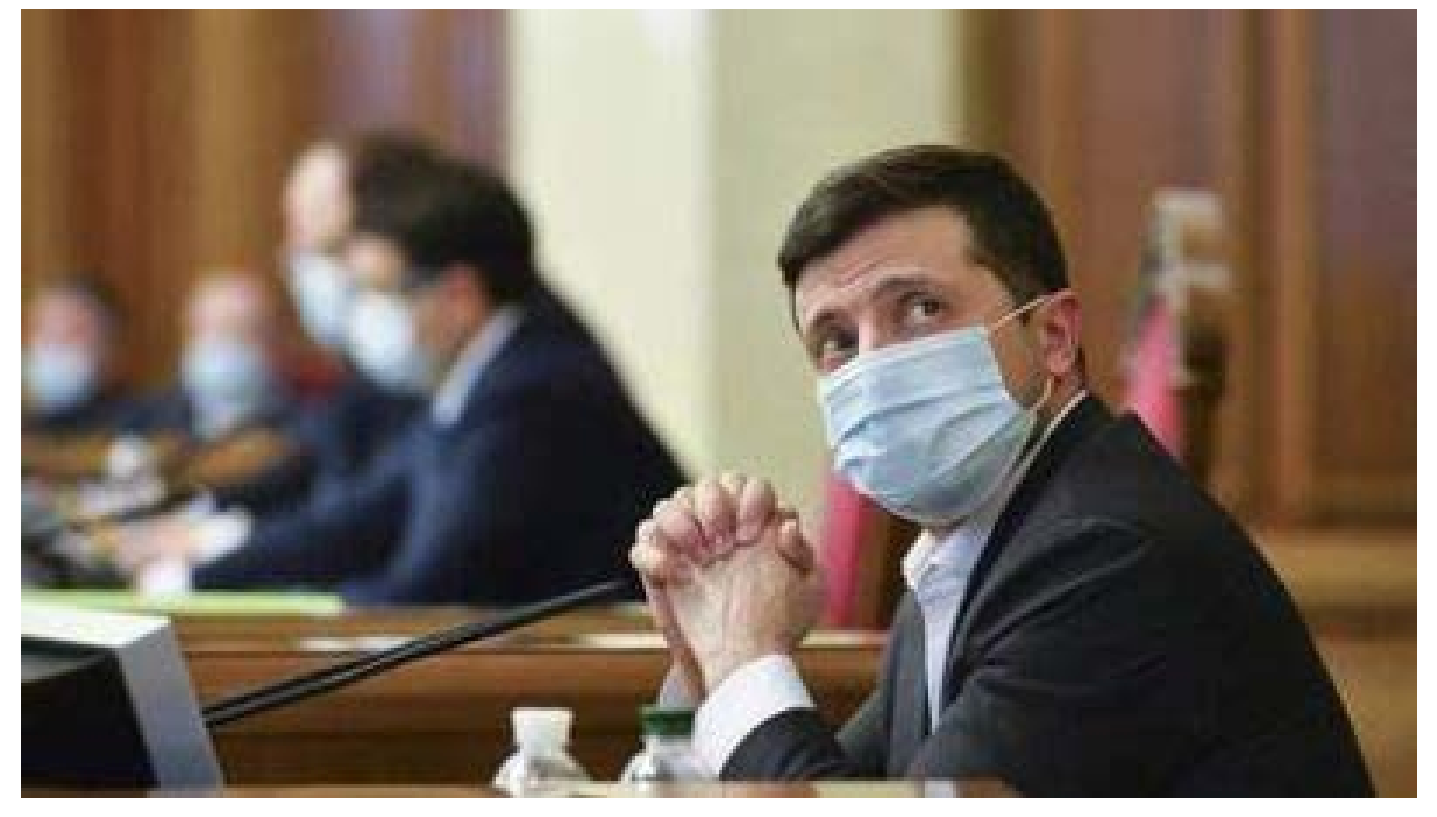
Zelensky at a meeting of the Verkhovna Rada

The hottest issues in Ukrainian society last year were fighting COVID-19 and attacking corruption infrastructure, with its partial leveling present sometimes. While the COVID battle is being fought in the hit-and-miss mode, ruining anti-corruption institutions by the team in power and its satellites was quite successful.