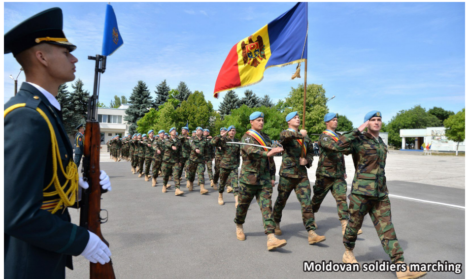
Moldovan soldiers marching

Russia's invasion of Ukraine has changed the paradigm of the national defense approach for several neighbouring states of Ukraine, including the Republic of Moldova. A prey to political indifference and a lack of vision, the national army of the Republic of Moldova has gradually and surely degraded in the 30 years of its existence.